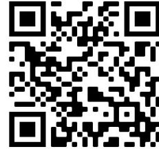
QR Code for Registration