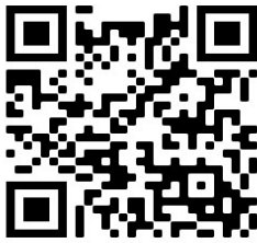
QR Code for Hospital Location